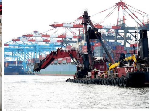
Navigation & dredging