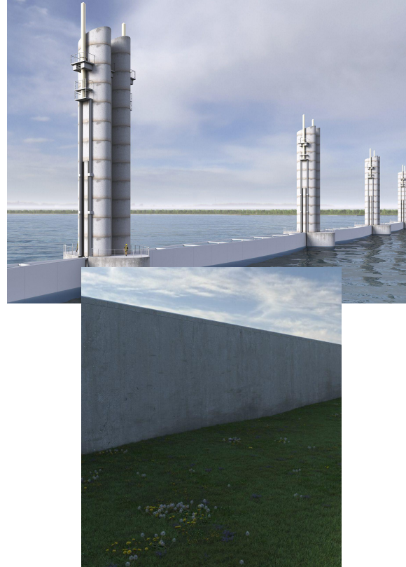
Galveston Bay area